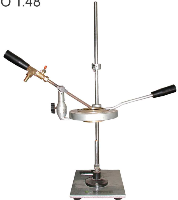
Flash And Fire Point By Claveland Open Cup

There are a number of test methods using different equipment with closed or open cups. The Cleveland flash cup apparatus is used to test cutback bitumen and may sometimes also be used to test penetration grade bitumen. The apparatus utilizes the open cup test method.