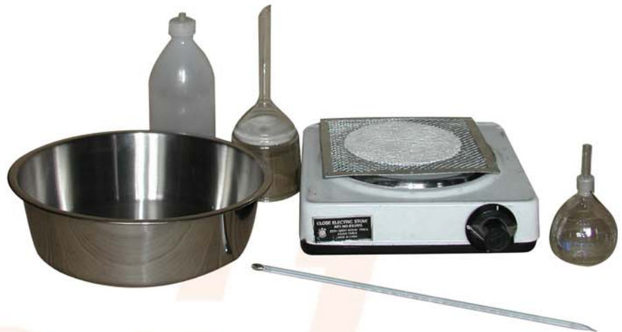
Specific Gravity Test

Particle density or specific gravity is a measure of the actual particles which make up the soil mass and is defined as the ratio of the mass of the particle to the mass of the water they displace a knowledge of the particle density is essential in relation to other soil tests.