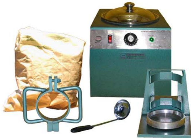
Vertical Cylinder Capping