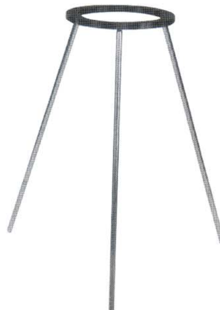
Flow Cone Stand