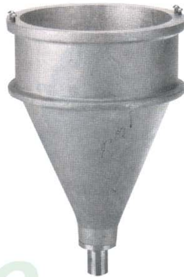
Grout Cone Stand

Cast-aluminium flow cone is used in the laboratory and field for determining flow of grout mixtures by measuring the time of efflux of a specified volume of grout from a standardized flow cone. Includes adjustable point gauge assembly. Overall dimensions: 8" dia. x 12"H (203x305mm).